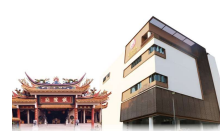
Lorong Koo Chye Sheng Hong Temple