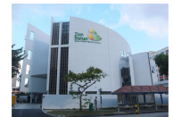
Zion Bishan Bible-Presbyterian Church