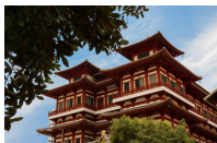
Buddha Tooth Relic Temple