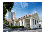
Cathedral of the Good Shepherd