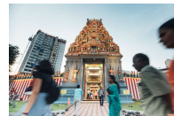
Sri Srinivasa Perumal Temple