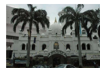
Silat Road Sikh Temple