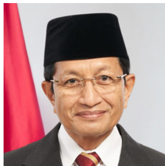
Prof Dr Nasaruddin Umar

Minister for Religious Affairs, Indonesia and Grand Imam of Istiqlal Mosque