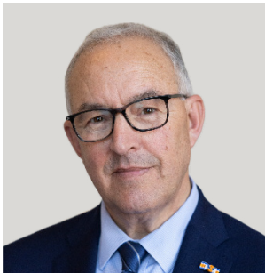
Mr Ahmed Aboutaleb

When he retired from the Singapore Administrative Service in 2010 after a career in the Public Service stretching more than 34 years, he was Head, Civil Service, concurrent with his other appointments of Permanent Secretary (Foreign Affairs), Permanent Secretary (National Security & Intelligence Coordination), and Permanent Secretary (Special Duties) in the Prime Minister's Office. Before that, he was Permanent Secretary (Defence). He was also the inaugural Chairman of the Maritime and Port Authority of Singapore.