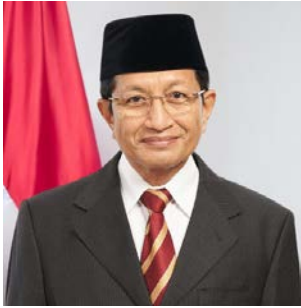
Prof Dr Nasaruddin Umar

Minister for Religious Affairs, Indonesia and Grand Imam of Istiqlal Mosque