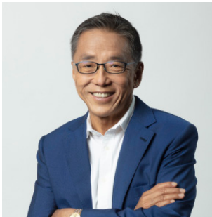
Mr Ho KwonPing

Active in the community, he has volunteered with senior care charities and served on various national and community boards. These include the School Advisory Committee, the Advisory Council on Community Relations in Defence (ACCORD), the executive committee of SINDA, and the Hindu Advisory Board.