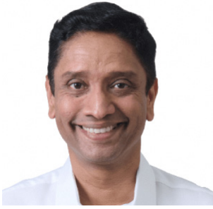
Mr Dinesh Vasu Dash

Minister of State, Ministry of Culture, Community and Youth, Singapore